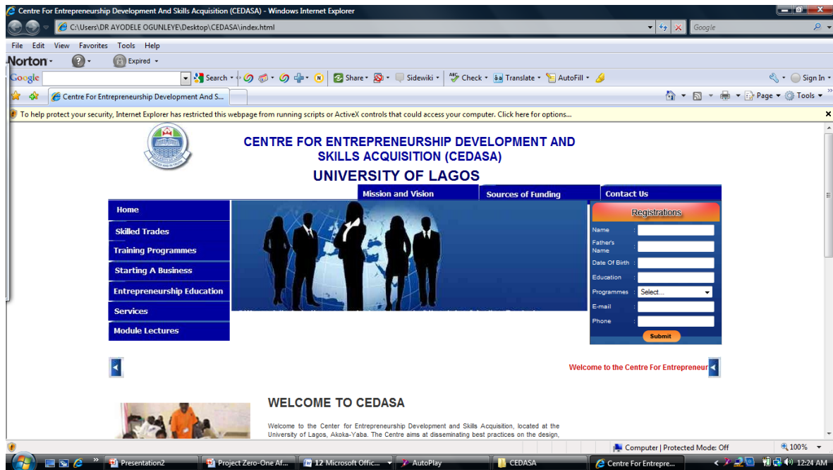
Figure 2. Centre for entrepreneurship development and skills acquisition homepage.